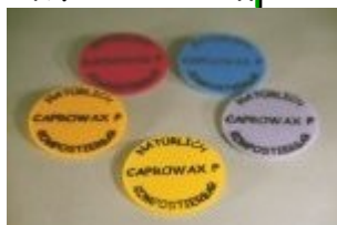
Coloured stones imitations