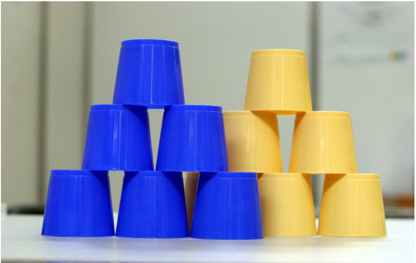
Product line with natural Biomineral Calcite (CaCO 3 ) CAPROWAX P™ 6006-C65-BM42030 / -BM42100 / -BM42150