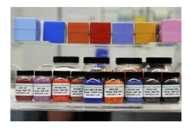
Master batches with compostable carrier material